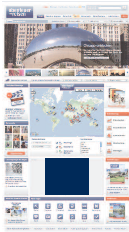
Content Ad / Small Rectangle (180 x 150 pixel)